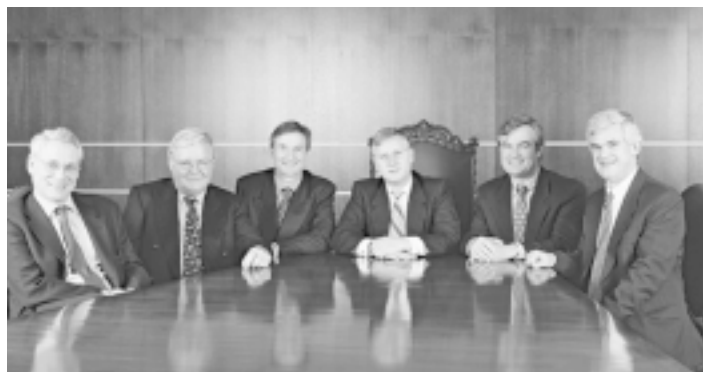
Bar Association Executive