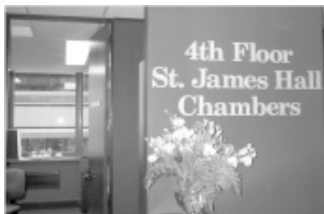
4th floor St. James, Hall Chambers