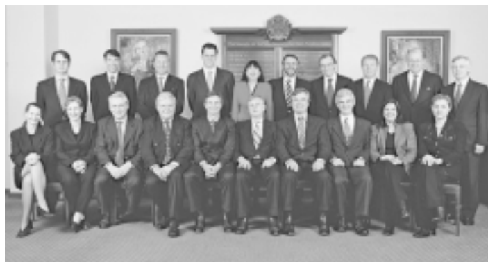
Bar Council 2002

1051 valid or partially valid votes were counted.